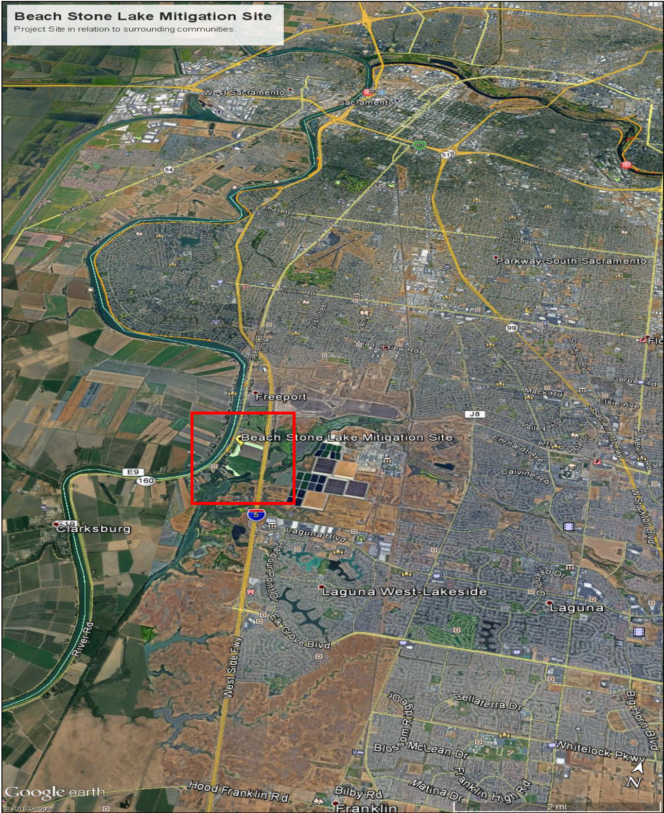
Figure 1. Beach Stone Lakes Mitigation Site Project Vicinity.