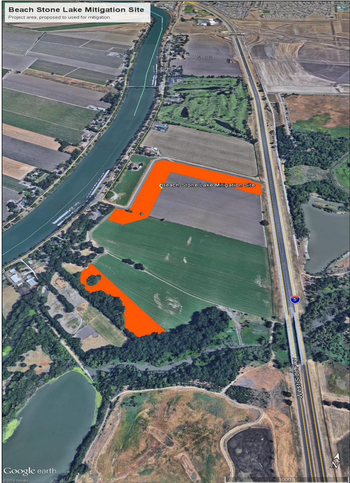
Figure 2. Beach Stone Lakes Mitigation Site